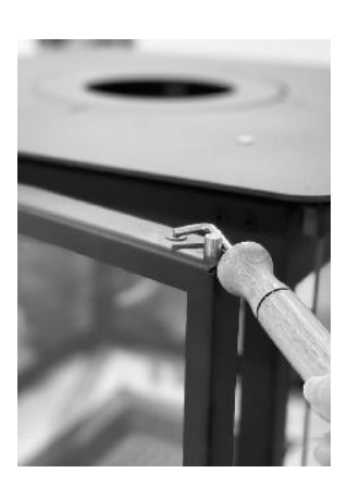
3a) Door accessory